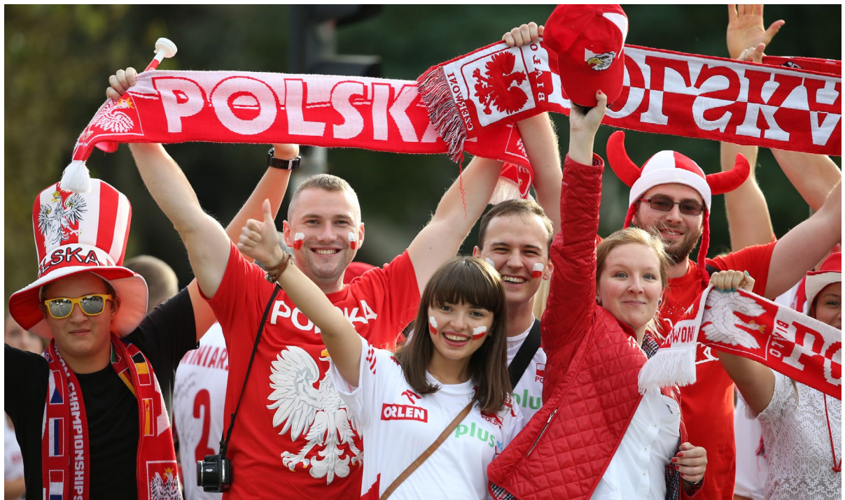
Photo: Polish fans on Volleyball Men's World Championship, Poland 2014. Opening match Poland vs Serbia.

Source: http://www.indexmundi.com/poland/demographics_profile.html