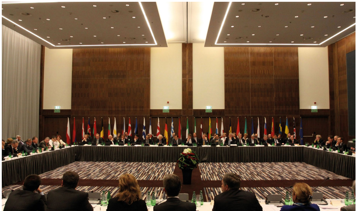
Photo: Eastern Partnership Meeting in Sopot 2015 / Eastern Partnership Meeting in Sopot 14m

Source: Polish Foreign Policy Priorities 2012-2016 , Ministry of Foreign Affairs of the Republic of Poland, Warsaw 2012 pp. 21-22, http://www.msz.gov.pl/resource/d31571cf-d24f-4479-af09-c9a46cc85cf6:JCR