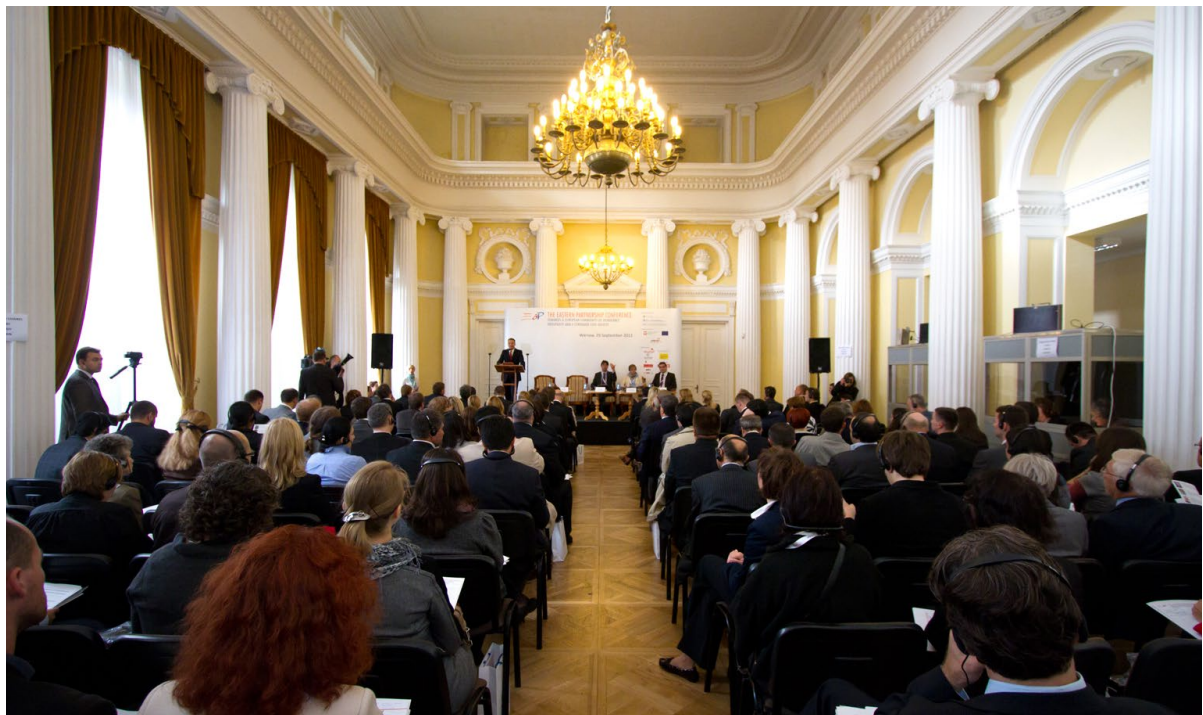
Photo: Eastern Partnership Conference 2003 / Ministry of Foreign Affairs of the Republic of Poland / Source: Flickr.com

http://eeas.europa.eu/eastern/platforms/docs/work_programme_2014_2017_platform4_en.pdf