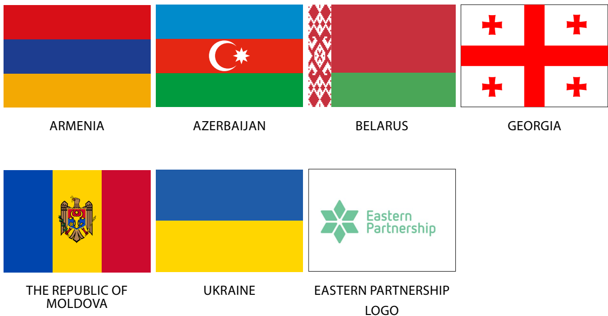
Design: flags of Eastern Partnership members, Eastern Partnership logo