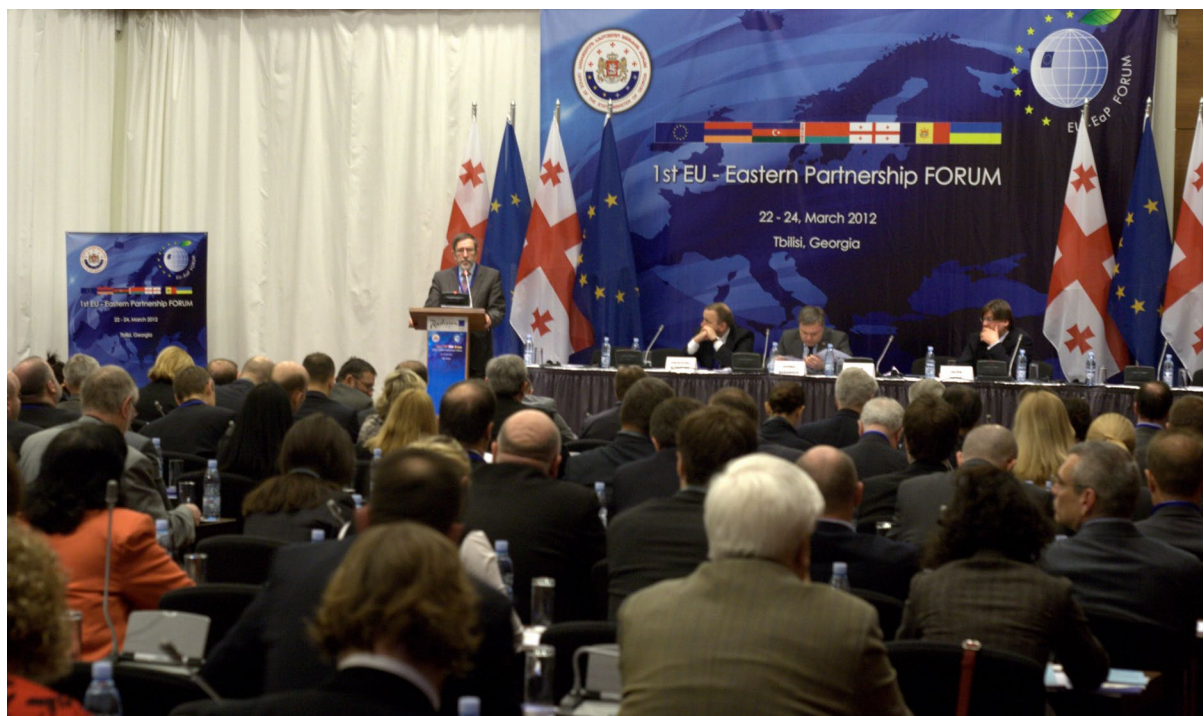
Photo: 1st EU – Eastern Partnership FORUM, Tbilisi 23.03.2012

http://eas.europa.eu/eastern/platforms/docs/work_programme_2014_2017_platform2_en.pdf